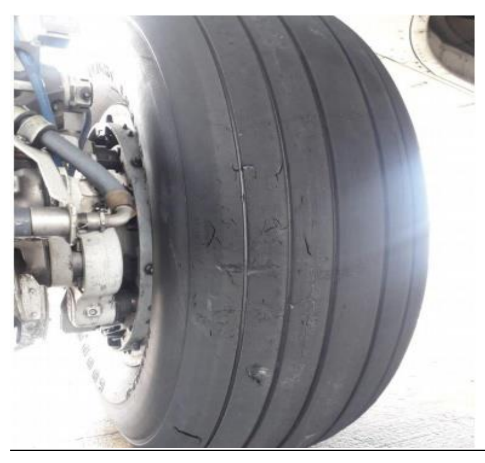
Cut Marks on no. 4 main wheel tyre.

1.4 Other damage: 05 runway edge lights on the right edge of runway 19L between taxiway 'K' and 'A' were damaged. Information of the damaged lights is given below: