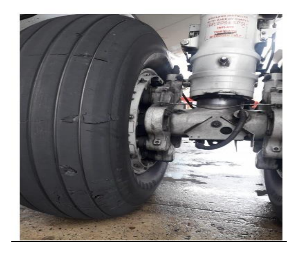
Cut Marks on no.3 main wheel tyre

1.3 Damage to the Aircraft: There were cut marks on several places on No. 03 and 04 tyres of the RH main wheel. The bearing cover of No. 02 main wheel was found damaged.