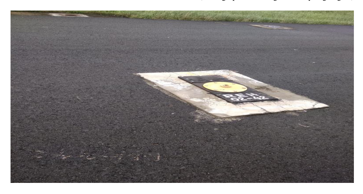
Appendix-B (Photographs of damaged runway edge lights)